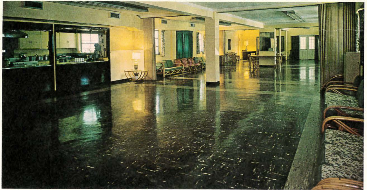
Dining room is 28' x 59', seats 220 comfortably. Kitchen included.