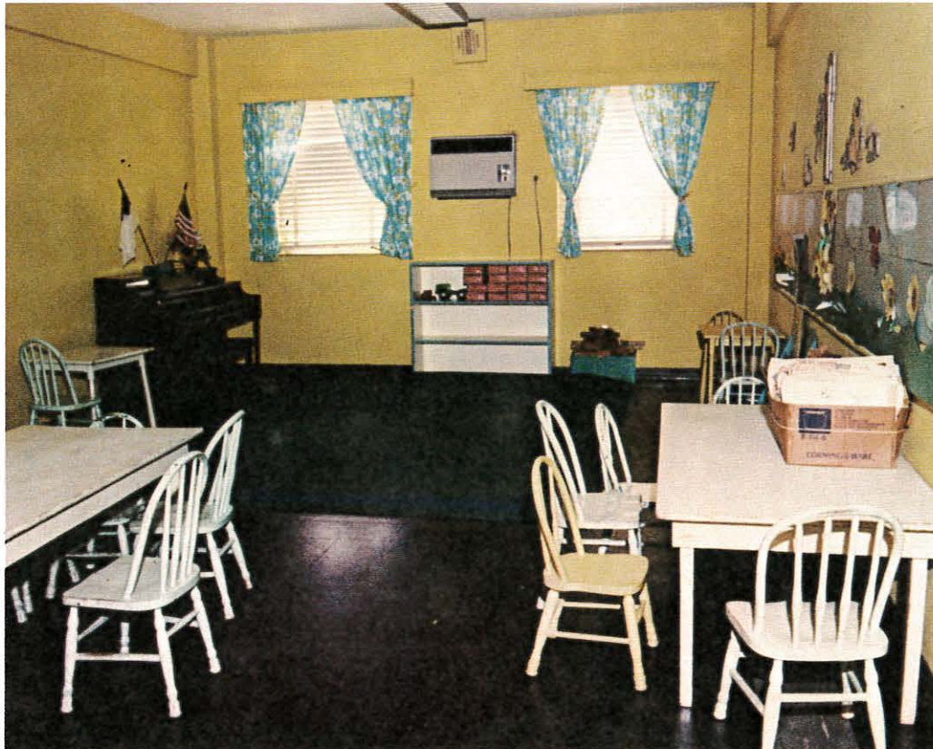
Typical classroom is one of 37 found in the two three-story classroom buildings.

TOTAL LAND AREA: 101,959 square feet (2.34 acres).