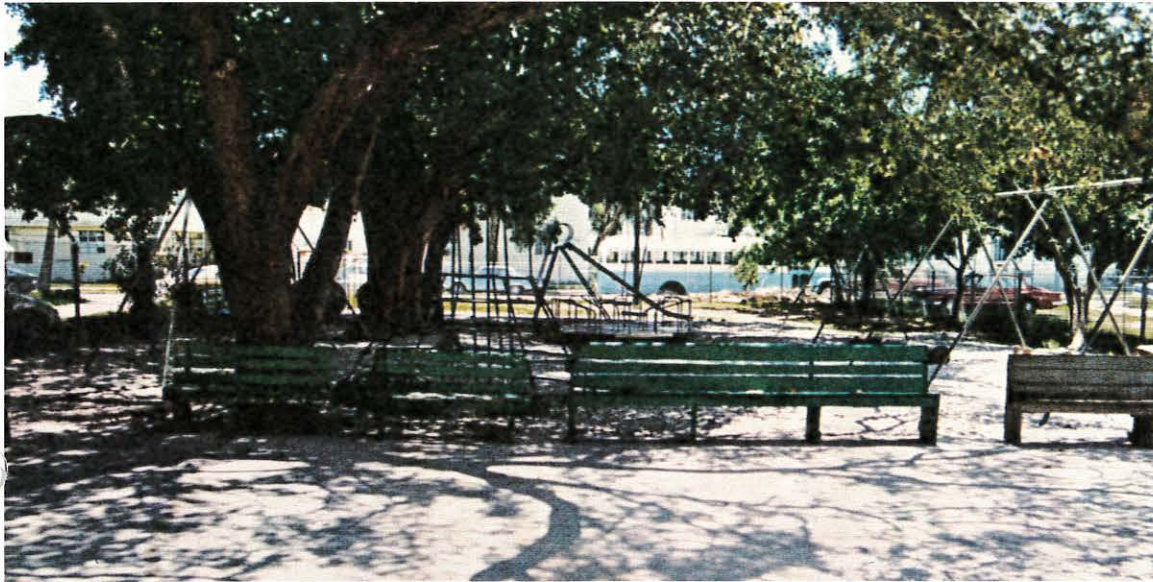
Playground contains approximately 15,000 square feet and is dotted with shade trees.