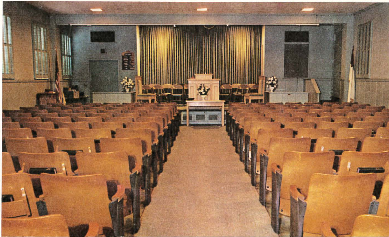
Chapel in classroom building is 32'x53' and seats 200.