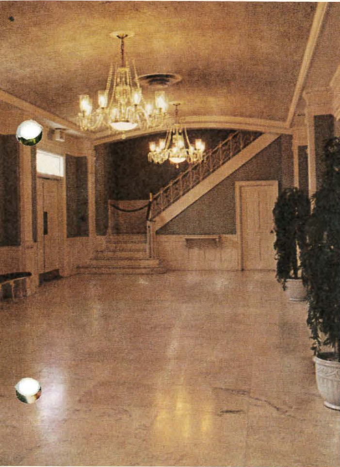
Lobby off auditorium features exquisite chandeliers and marble floors.

Examine the extremely well-maintained facilities on this 2.34-acre site: