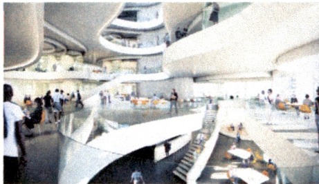
CBS, interior rendering

*Columbia University Business School , Education, New York, NY, USA (Competition, finalist); Client: Columbia University Facilities, ManhattanVille Development Group; Construction budget estimated 125M Euro