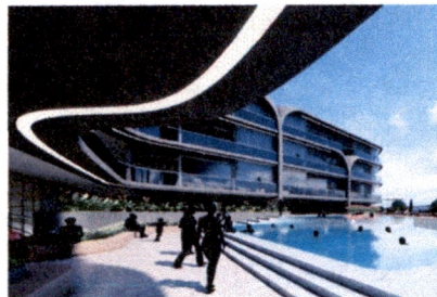
Helios, exterior rendering

*Helios by the River , Residential development, Miami, FL, USA, (Design Development); Client: Confidential; Construction budget $38M