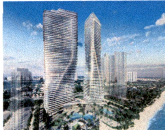
Varadero, exterior rendering