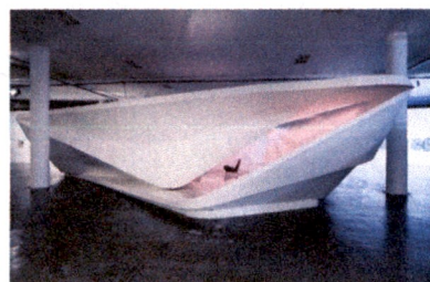
YouTurn Pavilion, exterior

RECEIVED 2025 AUG -4 PM 2:34 OFFICE OF THE CITY CLERK CITY OF MIAMI