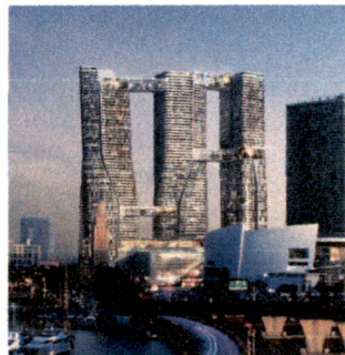
600/700, exterior rendering