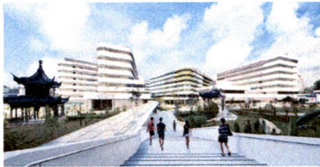
SUTD, site photograph

*SUTD Singapore University of Technology and Design , Singapore Education, (Competition, 1st prize winner, all phases, and completion 2015 in collaboration with DPA); Client: The Singapore University of Technology and Design; Construction budget 192M Euro