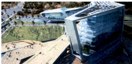
KEC, exterior rendering

*Korean Expressway Corporation , Busan, South Korea (Competition, finalist); Client: KEC Organization; Construction budget estimated $250M