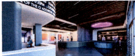
O Cinema, interior rendering

*Little River Cinema , Multi Theater, Miami, FL, USA, (Construction Documents); Client: O Cinema; Construction budget $1-2M