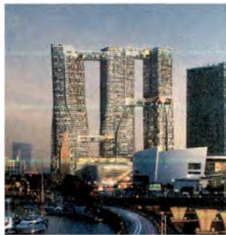
600/700, exterior rendering

*600/700 Biscayne Blvd , High-rises, mixed-use Miami, FL, USA, (Concept design); Client: Chateau Group; Construction budget undisclosed