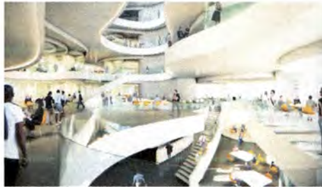
CBS, interior rendering

*Columbia University Business School, Education, New York, NY, USA (Competition, finalist); Client: Columbia University Facilities, Manhattanville Development Group; Construction budget estimated 125M Euro