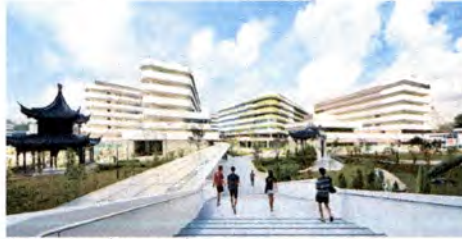
SUTD, site photograph

*SUTD Singapore University of Technology and Design, Singapore Education, (Competition, 1st prize winner, all phases, and completion 2015 in collaboration with DPA); Client: The Singapore University of Technology and Design; Construction budget 192M Euro