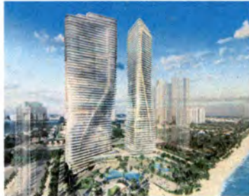
Varadero, exterior rendering

*Varadero , Residential high-rise, Sunny Isles, FL, USA, (Design development, completion 2026); Client: Fortune International/Chateau Group; Construction budget estimated $250M