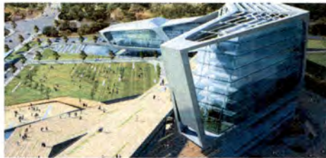
KEC, exterior rendering

*Korean Expressway Corporation, Busan, South Korea (Competition, finalist); Client: KEC Organization; Construction budget estimated $250M