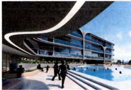
Helios, exterior rendering

*Helios by the River , Residential development, Miami, FL, USA, (Design Development); Client: Confidential; Construction budget $38M